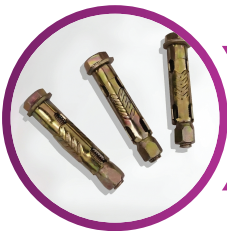
TAN Pipe Fastener