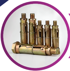
Rawl Bolt Fastener