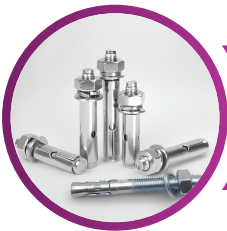
Ceiling Anchor Fastener