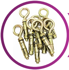
Rawl Hook Fastener